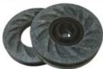
Stone Milling Heads #70-WJSTONE