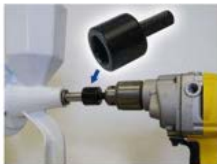
Drill Adapter #70-WJDA