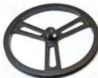
Motorizing Pulley #70-WJMP