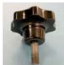
Adjustment Knob #70-WJADKNOB