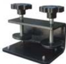
*Double Clamp #70-WJCLAMP