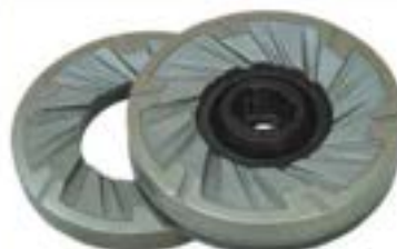
*Stainless Steel Burr #70-WJBURR