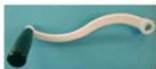
Handle Assembly #70-WJHANDLE

Parts marked with a * are only included with the DELUXE model, not the BASIC model.