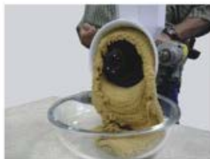
Great for Nut Butters