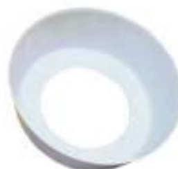
*Flour Guide #70-WJFG